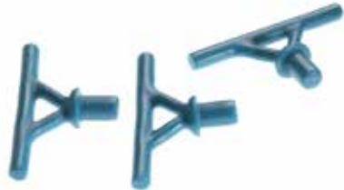
Order no. DH 500 101 NB 815 casting sprues, 100 units