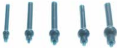
Order no. DH 000 204 NB 814 Head Ø 4 mm, Pin 2,50 mm, 200 units