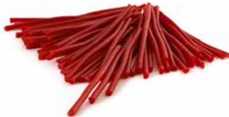
Order no. DRS H0040 red, rods Ø 5 mm, 15 cm lang, 450 g

In transparent box made of crystal clear polystyrene filled with orthodontic wax.