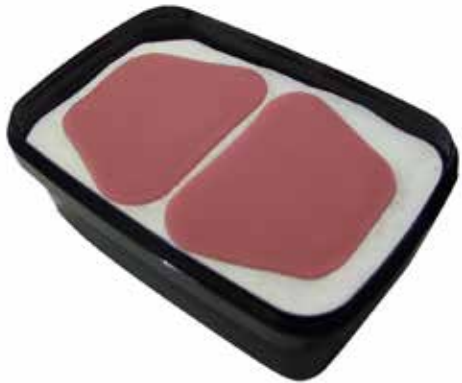
Order no. DH 000 301 NB 814 pink, 50 pieces per package