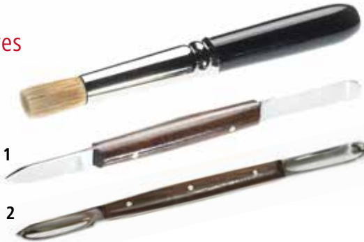
Order no. DM 000 140 NB 804 black, 1 piece

Waxknife 1, 130 mm long Waxknife 2, 130 mm long