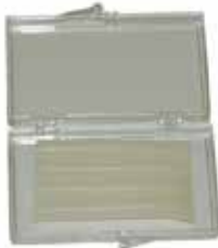
Order no. DRS H03950NB0 Kit/4 stripes (Ø 5 mm, 45 mm) 50 Kits/box

In transparent box made of crystal clear polystyrene filled with orthodontic wax.